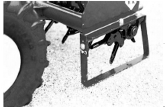
Support stands in ("down") position

Always remove rear weights when front attachment is removed.