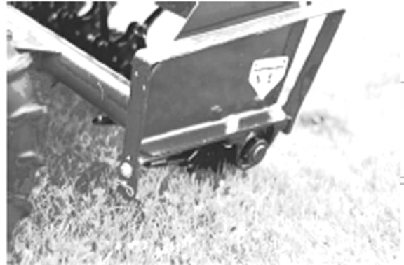
Support stands in operating ("up") position