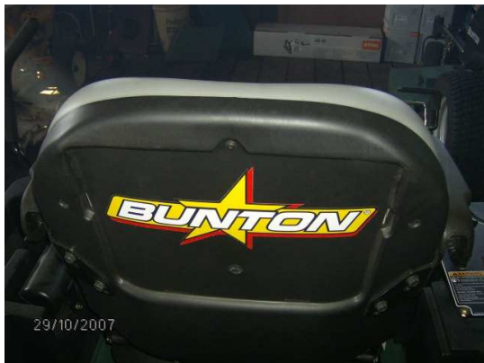
This is the V-5300