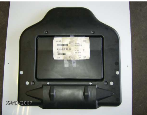
This is the V-5200

Part # 4122479 or Kit 970298 is the V-5300 seat THE PARTS FOR THE V-5300 ARE: