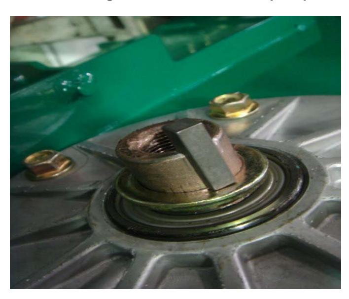
Kawasaki and Kohler units get two washers installed per spindle